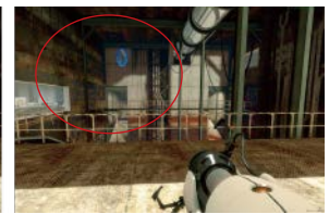
Shadow Control adjust to 80

• If picture is too dark to see the details clearly, adjusting up from 50 to 100 will lighten the dark portions.