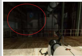
Shadow Control Default 50

With AOC Shadow Control, gamers can dial-in shadow levels in the OSD Menu to increase contrast for better dark area definition without affecting the rest of the screen.