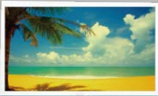
Regular Anti-Blue-Light Displays Regular ABL monitors also filter blue light, but this causes image discoloration.