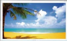
AOC Anti-Blue-Light Display AOC ABL technology filters 90% of harmful blue light, while still maintaining high color accuracy.