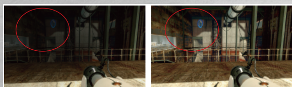
Shadow Control Default 50

AOC Shadow Control enables fast contrast adjustment of the in-game image. It improves areas of the screen that are too dark or washed out without affecting the rest of the screen.