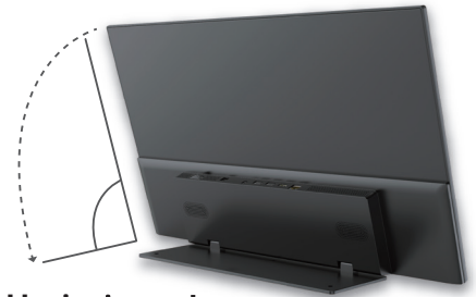
Adjustable viewing angle

The next-gen digital menu board, SPX24V2, exhibits enhanced flexibility, with its folding design accommodating various usage angles, catering to diverse scenarios and individual preferences. Moreover, the protective cover included offers robust protection against potential damage and ensuring heightened safety and durability.