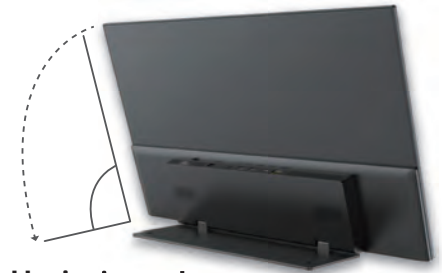
Adjustable viewing angle

The next-gen digital menu board, SPX24V2, exhibits enhanced flexibility, with its folding design accommodating various usage angles, catering to diverse scenarios and individual preferences. Moreover, the protective cover included offers robust protection against potential damage and ensuring heightened safety and durability.